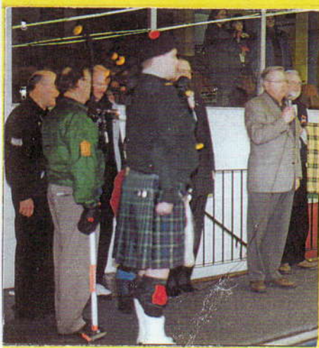
Opening of Friars' Briar ^