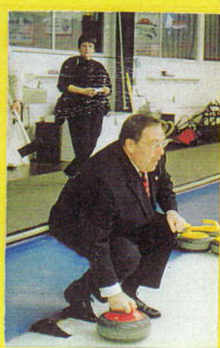
Mayor Atchison ^