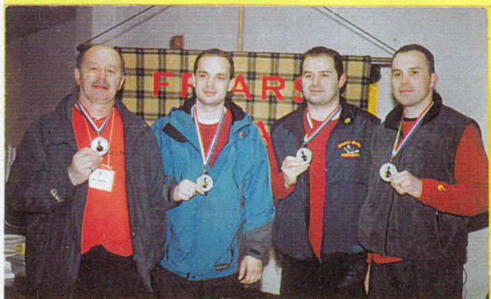
The Kiesman Rink ^ The David Hunter Rink v