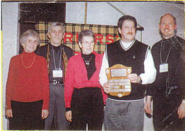
Wall Rink "Heavenly Host" winners ^