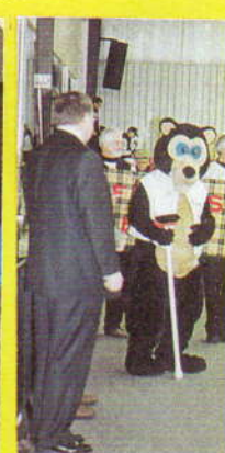
Nokia Brier Mascot