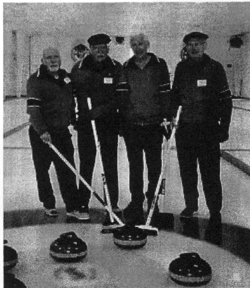
The Best Dressed curlers (for the 1980's)!