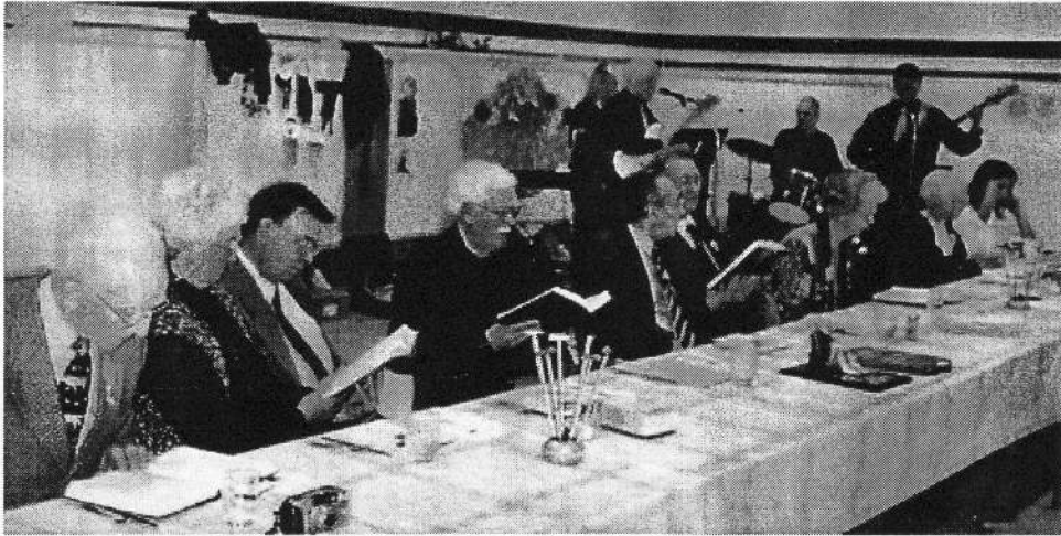
Singing with Voices United at the Banquet